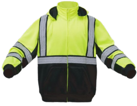
7511 - Lime