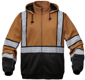
7514 - Khaki