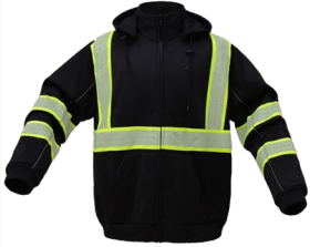
7513 - Black